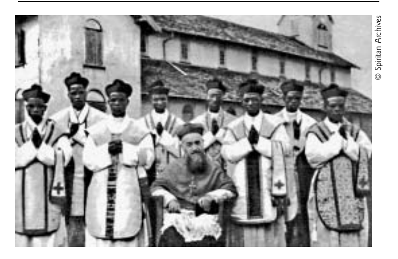
Bishop Franz Xaver Vogt with the first indigenous Cameroonian priests, 1935

find an appropriately respectful language for its encounter with non-Christian religions, one that avoids condescension or arrogance. Its most recent document, Dominus Iesus , published in 2000, evinces an obvious concern at the influence of 'relativistic theories which seek to justify religious pluralism, not only de facto but also de iure (or in principle )' (n.5). It insists on a distinction between full theological faith and mere 'belief in the other religions that constitutes the human treasury of wisdom and religious aspiration' developed and acted upon by humanity in its search for truth (n.7). The document's authors feel a need to specify what they mean by the equality of partners in interreligious dialogue: