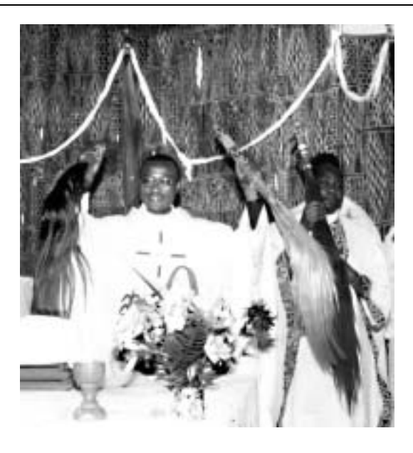
A newly ordained priest presiding at the Eucharist for the first time in Ngyembaland, Cameroon. The horses' tails that he and his assistant are holding are symbols of honour in their indigenous culture, as is the decorated awning behind them.

Nevertheless, what is at stake here is patchwork, and its dominant thrust is assimilationist. The purpose is not to encourage any sort of mutual enrichment between two equal partners, but rather to assimilate into Christian liturgy or doctrine values and symbols thought to be 'authentically' African. There have to be questions about the appropriateness of such a procedure; and it is certainly misleading to call it 'dialogue'. For all this is happening is that Christians are talking about African religions. There is no way for the African religions to talk back.