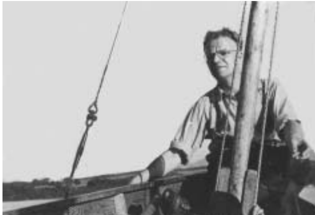
Alfred Delp sailing, 1943

Nazi regime could not tolerate, and planned for the future of Germany after Hitler's downfall. This consoled Delp uncannily. Previously his suffering and impending execution had had kein richtiges Thema : it had not been about anything sensible, anything of which Delp was really guilty. But now the values that had sustained all his living and acting, had become thematic: