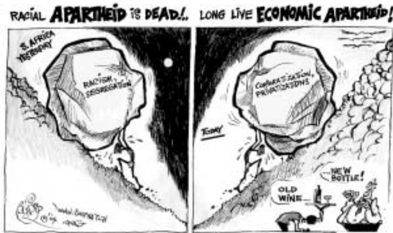
Chateau apartheid vs Cabernet globalisation

critical paradigm fully seriously', while the other section, on the whole English-speaking, made it appear,