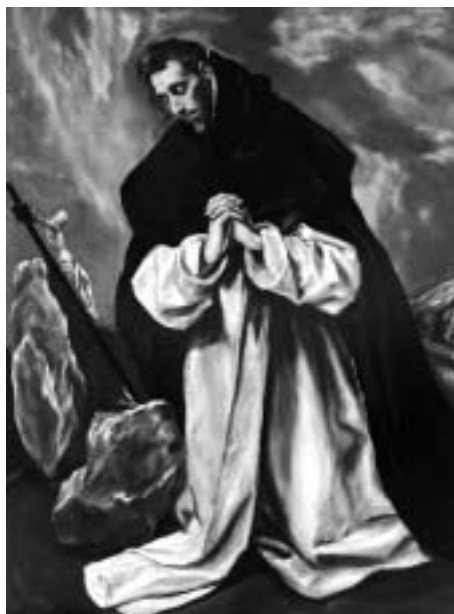
A Man Praying, by El Greco (1541-1614)

and Mary how they used their faculties and senses (Exx 248). There is a whole programme of learning here.