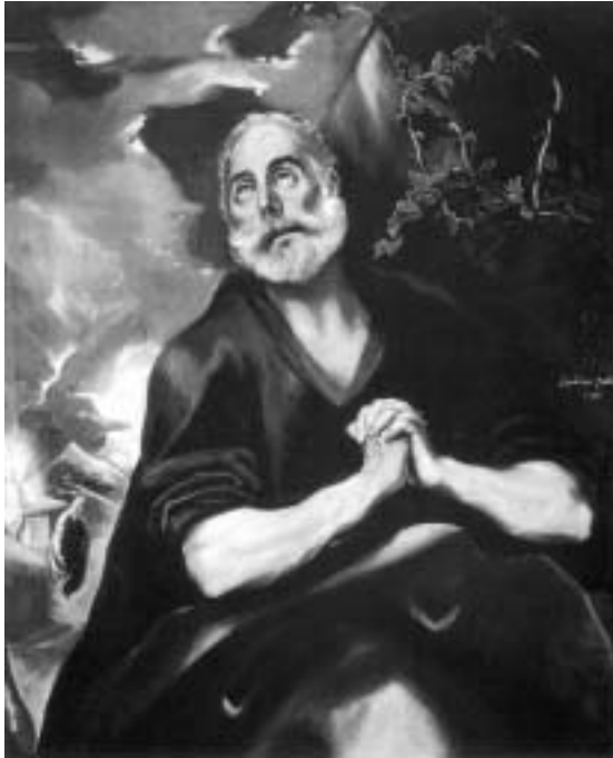
Peter Penitent, by El Greco (1541-1614)

the Son, and hence brothers and sisters to each other, arises not from sociology, nor from the fact that we happen to be nice congenial people. It comes as a sheer gift from God living among us, a gratuitous action of God's Spirit continuing to transform us if we allow that Spirit to act in our lives in such a way as to make each of us 'another Christ'.