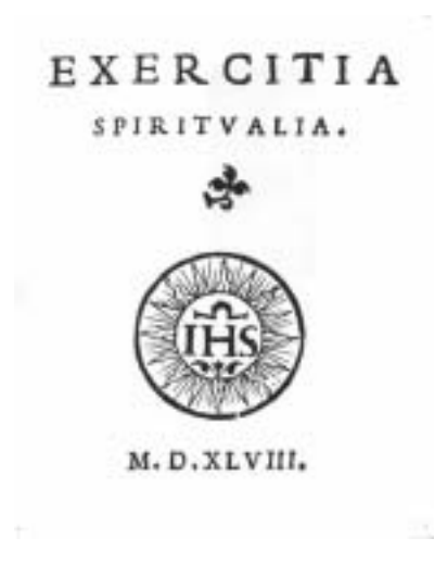
The frontispiece of the 1548 Vulgate text of the Spiritual Exercises

All these things, therefore, serve as immediate preparation for the person who is about to approach prayer; and without these, prayer is made rashly. But this is what happens with many people. Yet, conversely, the deeper a person immerses