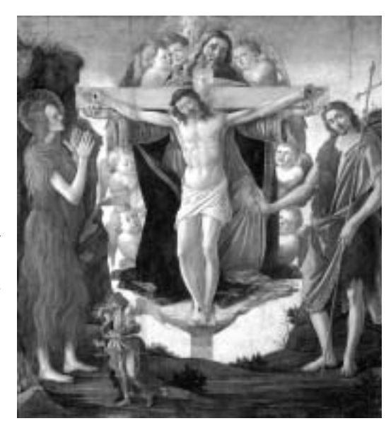
The Holy Trinity, by Botticelli

Such obviously anthropomorphic language is our limited expression of this amazing result of the mystery of the resurrection. This mystery reveals the Trinity to be intimately involved in the missioning of the risen Jesus. Our langfalters in uage an attempt to express fully the power and glory of