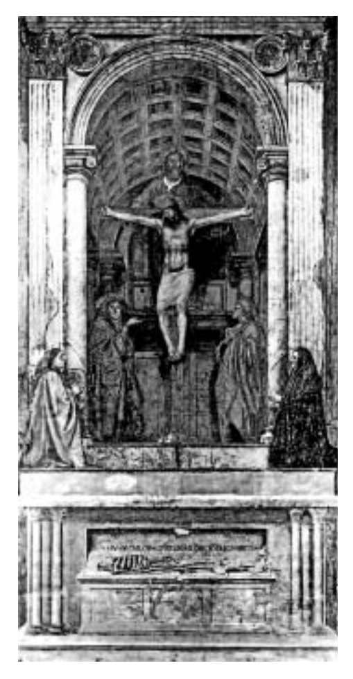
The Holy Trinity, by Masacchio

Daily life with the risen Jesus serves as preparation for the final extraordinary revelation that awaits us all. Jesus' resurrection is always contextualised and born in the paschal suffering and death of Calvary. The victory revealed in such suffering is nothing less than a miracle of grace accomplished by the Trinity. This victory is beyond any merely human capacity.