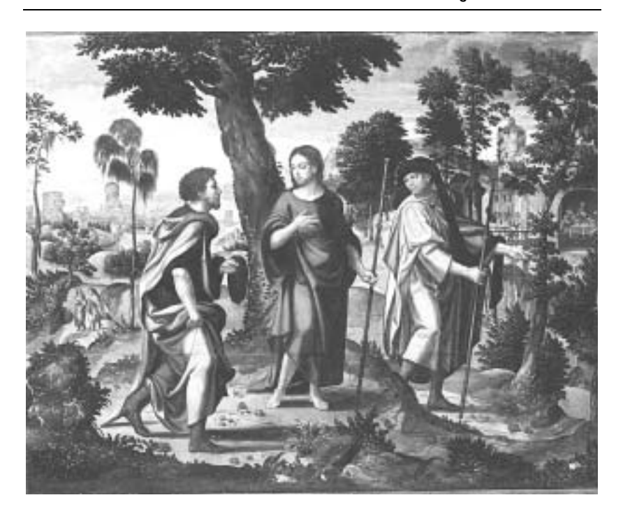
Christ and His Disciples on the Road to Emmaus, by Pieter Coecke van Aelst

The gift of profound joy beyond the level of our emotional fluctuations also has important pastoral implications. People who are grieving do not display any lack of faith if they experience a sober numbness that seems to refuse intense joy. They need time to feel, to internalise the event that has overwhelmed them. Pastoral ministers recognise better how to be with such people through a graced profundity rooted in Jesus' joy, than through some excessive desire to help them find an intense rejoicing. Profound joy is usually more flexible and capable of a great variety of expression in different ministerial settings.