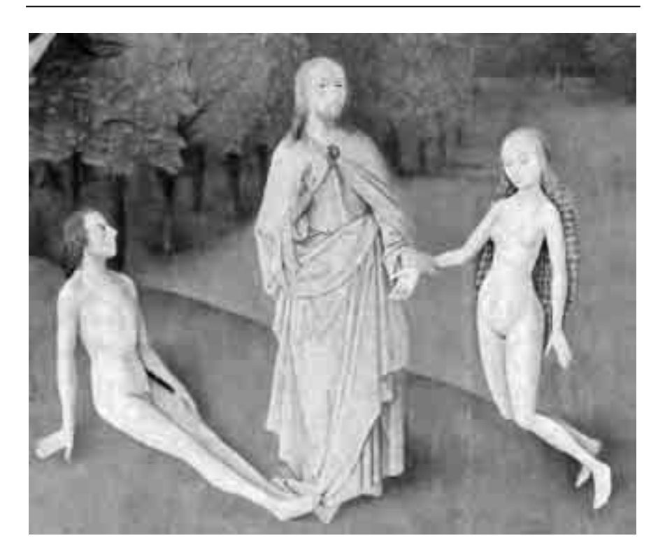
Christ presents Eve to Adam, detail from The Garden of Earthly Delights, by Hieronymus Bosch

or subversive attempts to bring about heaven on earth.<sup>56</sup> The role of apocalyptic theology in stimulating radical ideas suggests that even Weber's nuanced distinction between two types of mystic or ascetic, the innerweltliche (innerworldly) and ausserweltliche (outerworldly), is no more persuasive than Troeltsch's model. It has also been noted in the pages of this journal that mystical spirituality and social critique go hand in hand, and form part of a joined-up cycle of reflection and action.<sup>57</sup> Reading the work of the seventeenth-century feminists has