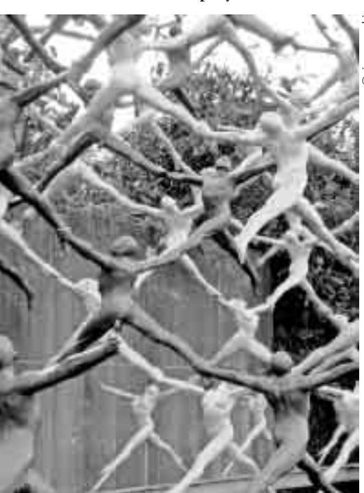
Intersecting Space Construction, by Ryoji Goto

For in a society of citizens, the independence of the individual is an illusion and the isolated self a nonentity. As citizens we only exist