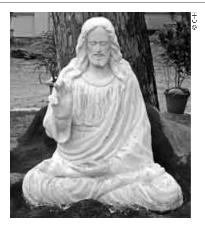
Statue of Christ at the Portuguese Church, Kumarakom, India

Griffiths found a point of reconciliation for Hindus and Christians. His insight is also important for Christians because it allows for the world to be seen in a positive light. That is, it allows Christian theology to make sense of the world not as being at odds with God, but rather as a sacramental presentation and mode of being for God, the creator. Still further, the implications of this pan-sacramental cosmology have enduring importance for the way Christians understand human nature. Like the natural world, human beings can be seen in a positive light. As creations in the image and likeness of God, humans also contain the potential for sacramentality. This is important because it retains a positive view of human nature and does not ignore the doctrine of imago dei —people as creatures in the 'image and likeness of God'.