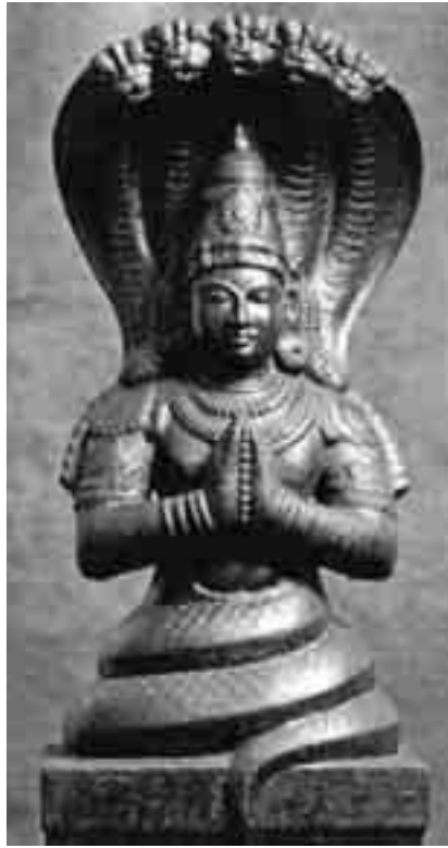
Patañjali, represented as the Hindu god Ananta

and durable spiritual path in the Hindu, Buddhist and Jain traditions. The term first appeared in the Katha Upanishad , written between 800 and 600 BC, and underwent steady development within the Hindu religious world. It was embraced within the Jain religious matrix in the sixth century BC by Vardhamana Mahavira, and was later incorporated into Tibetan Vajrayana Buddhist practice. The Indian author Patañjali, its most famous expositor, wrote the Yoga Sūtra in the second or third century AD, establishing a tradition of sustained exegesis and commentary which extends to the present day. 6