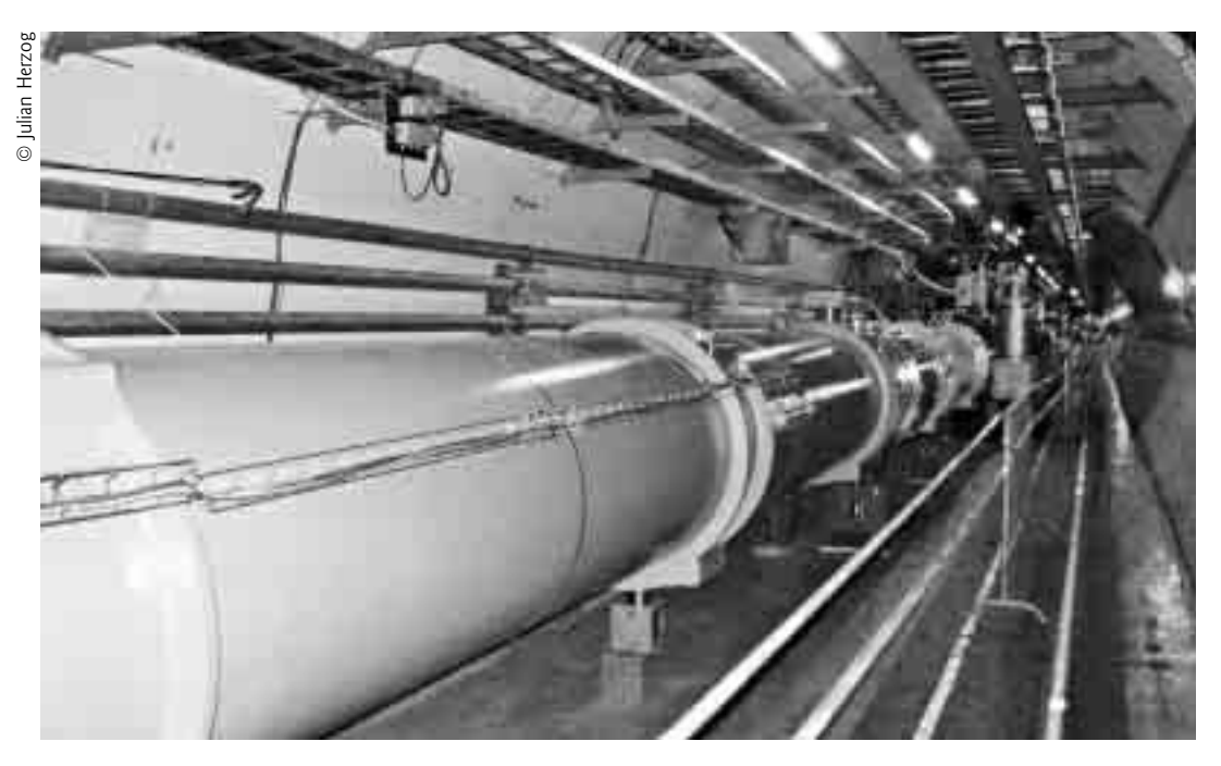
The Large Hadron Collider

First, it limits our knowledge of reality to what technology can demonstrate, and thereby links the scope of knowledge to the reach of technology. For example, recent experiments conducted by the CMS detector at the Large Hadron Collider at CERN, which verified the