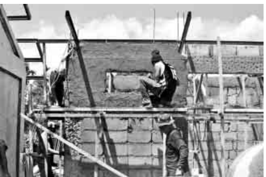
Project Ma2wa volunteers at work in the Philippines