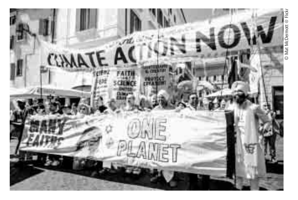
Interfaith demonstration in support of Laudato si' at the Vatican

While Laudato si' addresses the demand from within the institutional Church for an integral ecology, spiritual depth and a renewed commitment in faith and solidarity, it also engages global dialogues and processes of change. Given the integrated and inclusive concerns it raises, it is part of a discussion about human development and the global market as well as the Church. What it says is consistent with the aims of United Nations meetings such as the Sustainable Development summit in New York of September 2015, and the Conference of the Parties to the United Nations Framework Convention on Climate Change (COP21), which will meet in Paris in December 2015, but it is able to go beyond them. The encyclical imparts an energy for change, for people to gather on the streets and