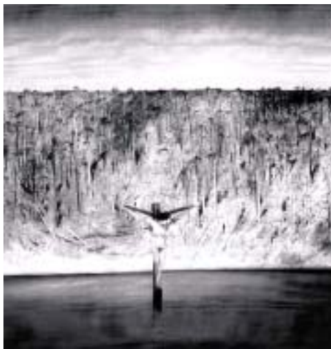
Crucifixion, Shoalhaven, by Arthur Boyd

sexual abuse have encountered Church institutions which want to pretend that sexual abuse does not happen within the confines of Christianity or to committed Christians. Such attitudes may also have contributed to the silencing of individuals, and to their having become unable to speak about the impact of sexual abuse on their religious experience, 17 even though that impact may have been profound. 18