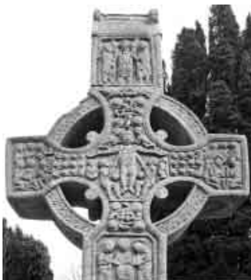
Celtic High Cross, Monasterboice