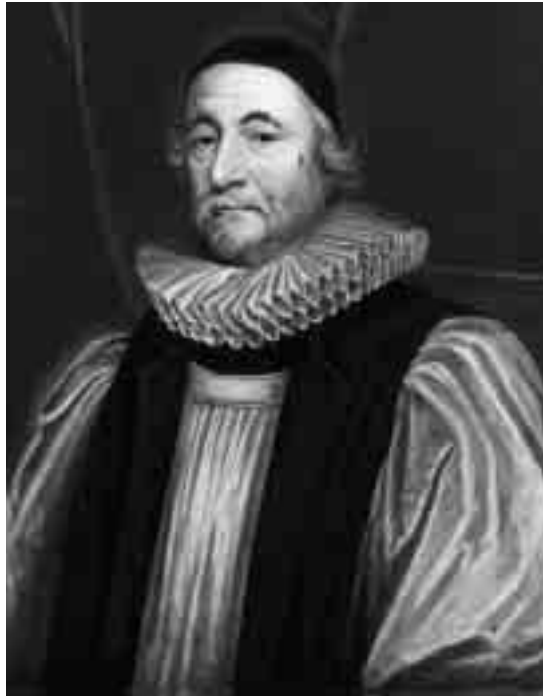
Bishop James Ussher, by Lely

Augustine and Aquinas, who address issues that Hawking and Mlodinow seek to resolve, are neglected. Instead, they refer to Bishop Tempier of Paris who, instigated by Pope John XXI, published a list of heresies in 1277, including the idea that nature follows laws, seen as conflicting with God's omnipotence. 25 They also quote Bishop Ussher, primate of All Ireland between 1625 and 1656, who calculated the date of creation to 27 October 4004 BC. 26 Had they—or Ussher, for that matter—consulted Augustine's commentary on Genesis, they would have read that Augustine rejected the literal reading of the Genesis creation accounts, stating that: