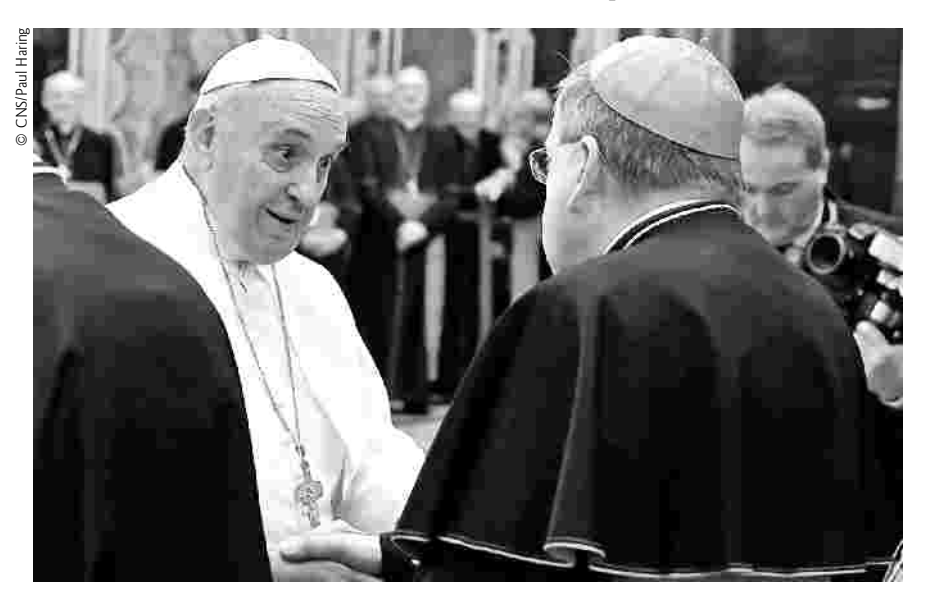
Pope Francis and Cardinal Burke at the Vatican in 2014

One, which we might call, after the Russian president, the 'Putin Option'—although Matteo Salvini in Italy and Donald Trump in the United States would also be contenders to give it a name—seeks to press the Christian Church in general, and Rome in particular, into the service of an authoritarian nationalist project of remoralisation, using the coercive power of the state to reassert the collective over the individual, and to protect 'western Christian civilisation' by, among other things, closing its borders to Muslim migrants. Cardinal Raymond Burke and his followers have expressed admiration for the ideas of Steve Bannon, founder of the right-wing Breitbart News website. Bannon is involved in crafting a training programme for future Catholic leaders organized by the Rome-based Dignitatis Humanae Institute presided over by Burke.<sup>3</sup>